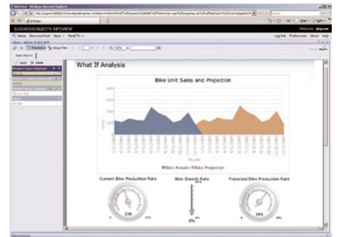
Figure 3: Crystal Reports® Server: End-User Interface

The interactive, Web-based report viewer included with Crystal Reports Server requires little to no training and enables you to print, export, and drill down into charts and groups. You can take advantage of on-report parameter panels, sort controls, and support for embedded Flash to become more productive and to reduce the number of reports needed to answer critical business questions.